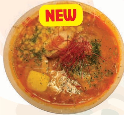
HOKKAIDO MISO BUTTER CORN miso and pork broth and topped with a dollop of butter and corn kernels