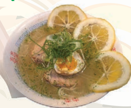
TOKYO SHOYU RAMEN Soy and pork broth