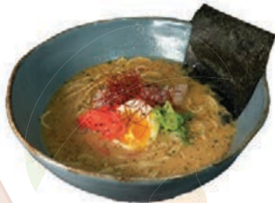
MISO TONKOTSU RAMEN Miso and pork based broth