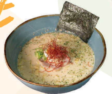
CREAMY SESAME RAMEN Pork broth soup with ground sesame