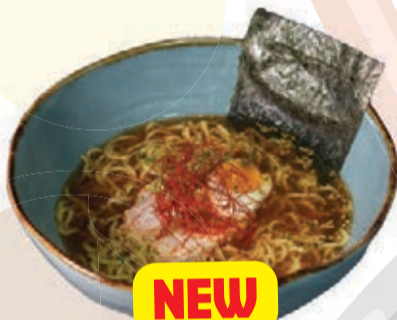
SHOYU TONKOTSU RAMEN Soy and pork based broth