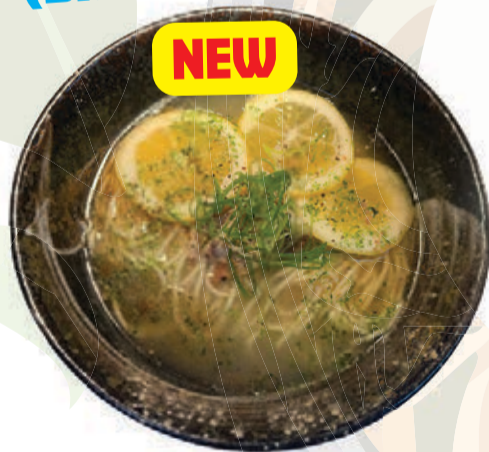
SHIYO LEMON RAMEN Salt and pork based broth infused with lemon juice and topped slices of lemon