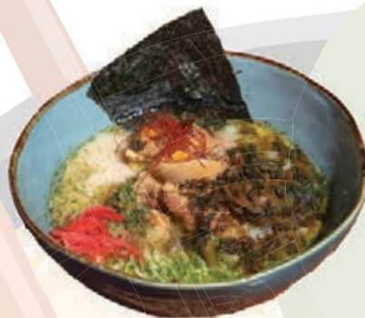
HAKATA RAMEN Hakata style pork based broth with takanazuke (pickled mustard green)