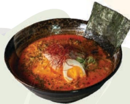
SPICY SESAME RAMEN Pork broth with ground sesame and spicy chilli oil