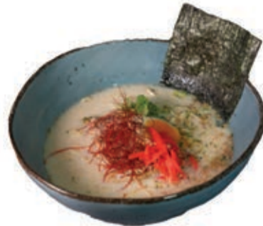
TONKOTSU RAMEN Pork broth