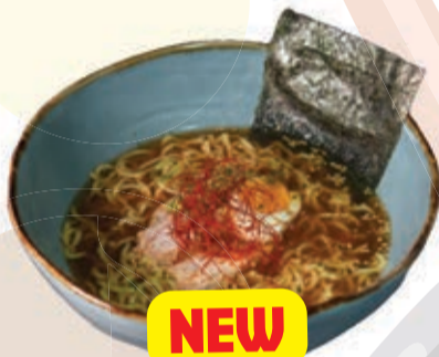
SHOYU TONKOTSU RAMEN Soy and pork based broth