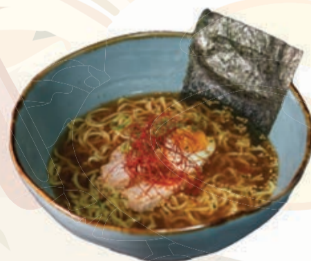
TOKYO SHOYU RAMEN Soy and pork broth