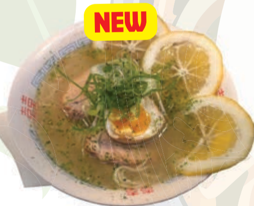
SHIYO LEMON RAMEN Salt and pork based broth infused with lemon juice and topped slices of lemon