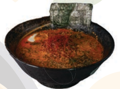
TAN TAN MEN Miso and pork broth, grounded sesame, spicy chilli oil and topped with spicy chicken mince.