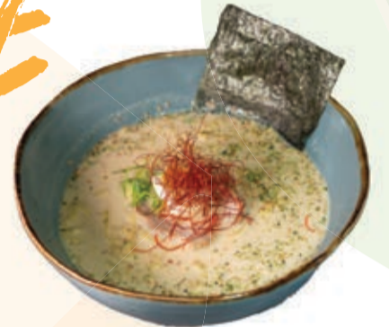
CREAMY SESAME RAMEN Pork broth soup with ground sesame