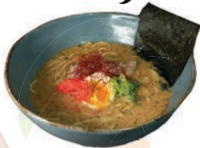
MISO TONKOTSU RAMEN Miso and pork based broth