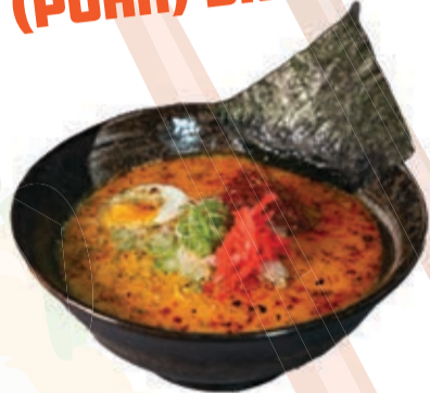
BLACK TONKOTSU RAMEN Black charred garlic oil with pork broth