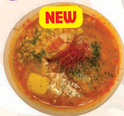
HOKKAIDO MISO BUTTER CORN miso and pork broth and topped with a dollop of butter and corn kernels