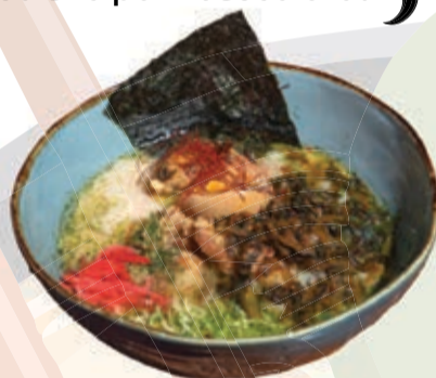
HAKATA RAMEN Hakata style pork based broth with takanazuke (pickled mustard green)