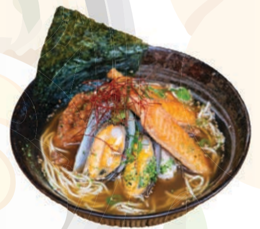
KAISEN RAMEN Soy and pork broth with today's seafood toppings.