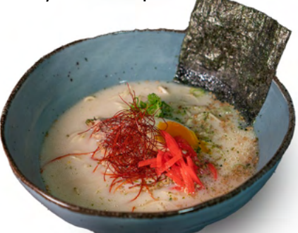
Tonkotsu Ramen Pork broth soup.